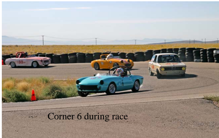
Corner 6 during race