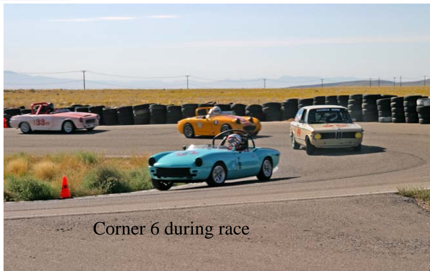
Corner 6 during race