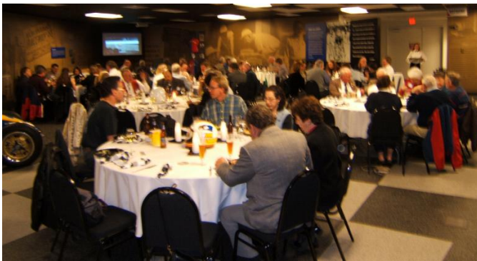
Dinner is served —'checkered' floor & racing decor